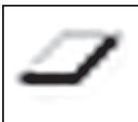
Shear X Angle